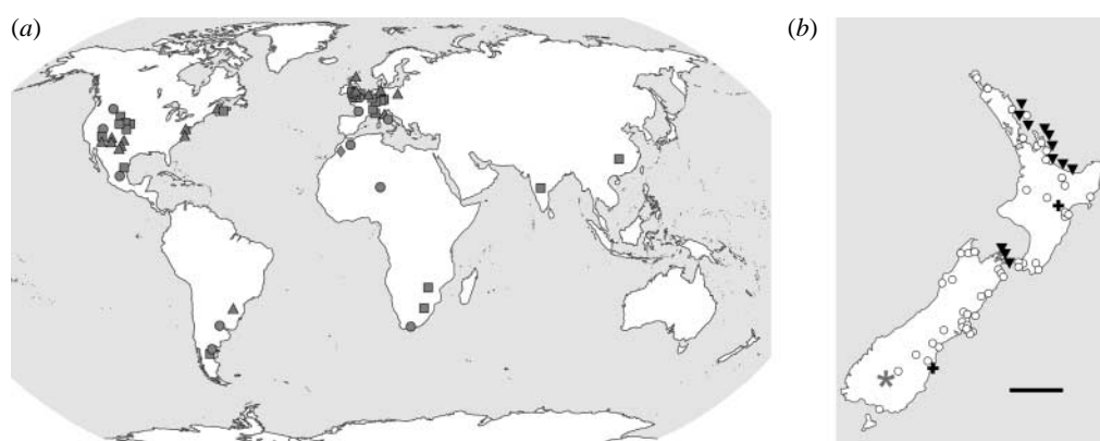
Figure 1. Rhynchocephalian localities. (a) Global map showing fossil localities (see the electronic supplementary material). (b) New Zealand, redrawn from Hay et al. (2003). Triangles, Triassic; squares, Jurassic; filled circles, Cretaceous; diamonds, Palaeocene?; asterisk, Miocene; pluses, Pleistocene; open circles, Holocene; down triangles, extant populations. Scale bar, 200 km. 175×73 mm (600×600 dpi).