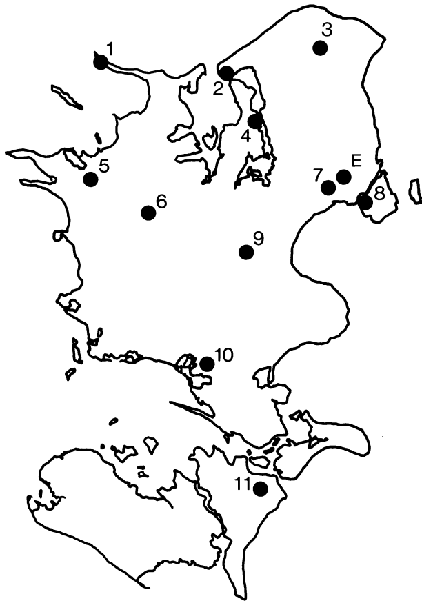
Figure 1. Map of the localities in eastern Denmark where collections were made. 1: Gniben; 2: Lynæs; 3: Solbjerg; 4: Skuldelev; 5: Bjergsted; 6: Assentorp; 7: Taastrup; 8: Amager; 9: Kværkeby; 10: Myrup; 11: Maglebrønd; E: Ejby.

the populations previously studied (Taastrup and Ejby; Nielsen 1997b) are representative for the presence of R -genes in other flea beetle populations in eastern Denmark.